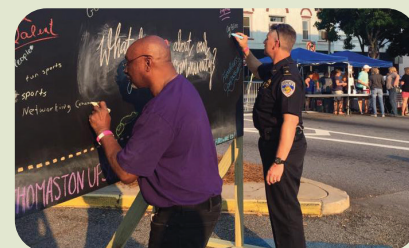
Thomaston Heart & Soul, Georgia