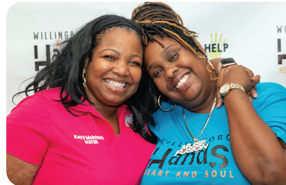
Willingboro Heart & Soul, New Jersey